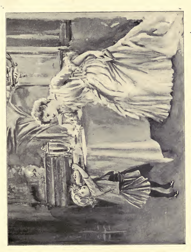
HIS INITIAL ACT OF CHARITY: "LADY," HE SAID, "LADY, F'ONT DOOR-WANT B'EAD,"